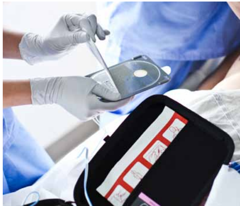
The HeartStart FR3 is the smallest and lightest professional-grade AED among the leading global manufacturers.